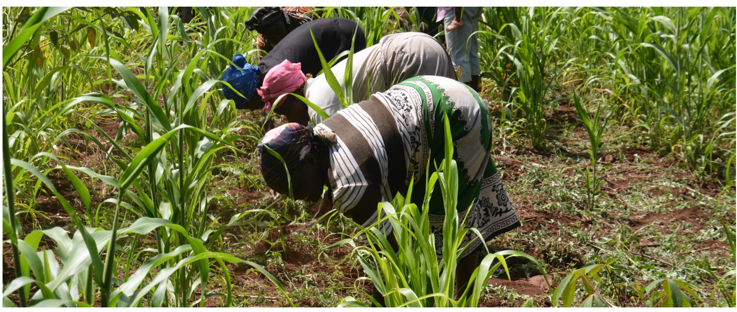
Women casual labourers in Tharaka Nithi county weeding a maize farm

You can't succeed on one without addressing the other.