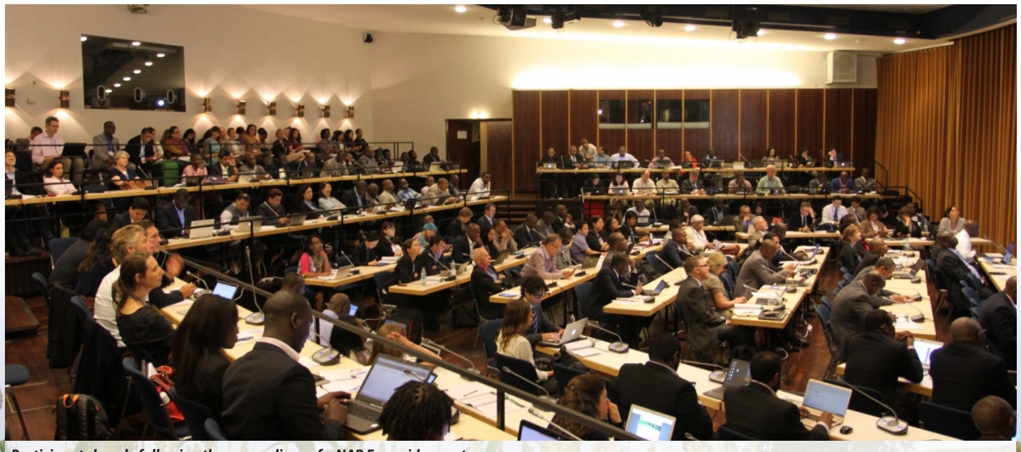
Participants keenly following the proceedings of a NAP Expo side event.

a highly participatory process that included several meetings with the Adaptation Thematic Working Group (TWG), the NCCAP national task force, county consultations, civil society and private sector meetings.