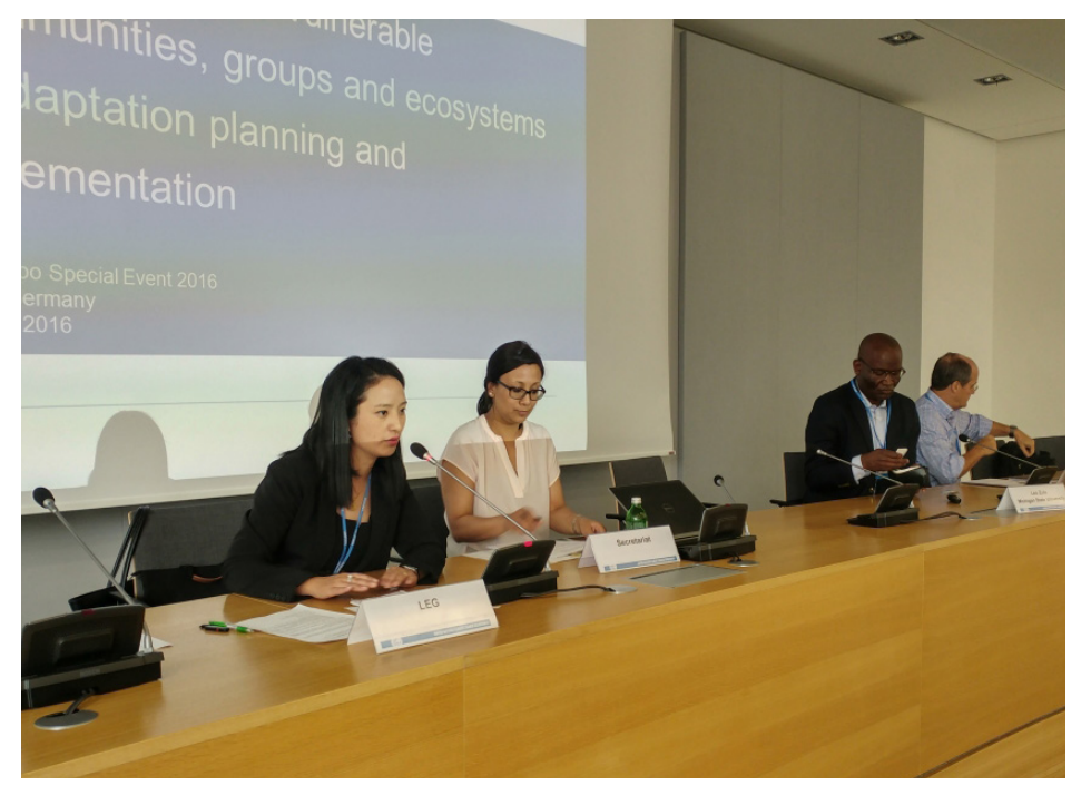
A representative of the Least Developed Countries Expert Group (LEG) makes remarks during the 2016 NAP Expo held at UNFCCC Headquarters in Bonn, Germany

that will enable Kenya implement some of the proposed actions in its National Adaptation Plan (NAP). Execution is already ongoing under the Integrating Agriculture in National Adaptation Plans project.