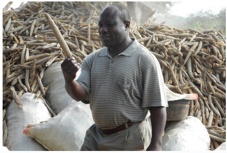
Farmer in Meru assessing the quality of harvested millet

5.0 Study to Assess Institutional Barriers to National Adaptation Plan Implementation in Kenya's Agriculture Sector commissioned