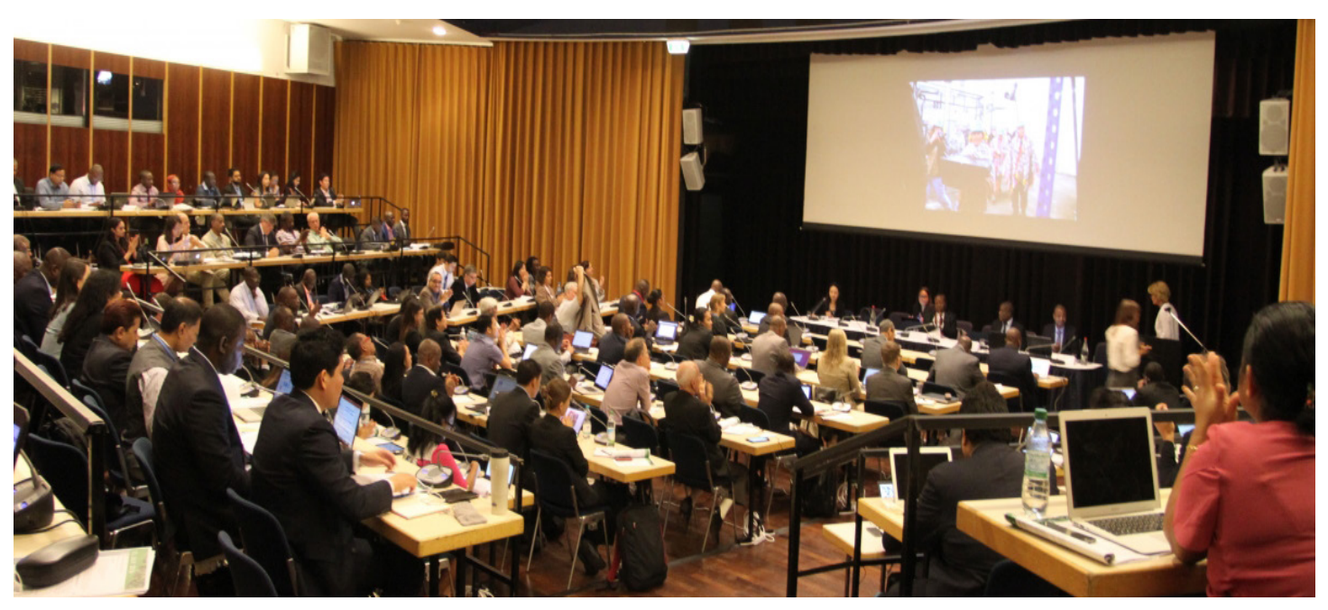
Participants keenly following proceedings during the 2016 NAP Expo.

ow can institutions access funding from the Green Climate Fund (GCF) and what are the global goals on adaptation? Can the global temperature limit be translated to the national scale? These and other questions that developing nations continue to grapple with in the face of climate change were discussed during this year's National Adaptation Plan (NAP) Expo that took place from 11th to 15th July at the United Nations Framework Convention on Climate Change (UNFCCC) Headquarters in Bonn, Germany. The five day event