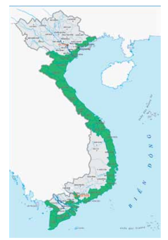
Figure 2: 28 coastal provinces benefit from the GCF-UNDP project