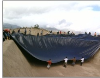
Retention ponds construction San Bartolomé—Azuay, Ecuador

SCCF interventions in San Bartolome: San Bartolomé, located forty five minutes away from Cuenca, the capital of Azuay province, is inhabited mostly by women, as men have migrated looking for better working conditions. For this reason, women in San Bartolome play a fundamental role in providing livelihoods for their families. SCCF finance is used by communities to ensure a supply of water resources for agriculture activities during the dry summer season. To support agricultural activities performed by women, SCCF funds have also