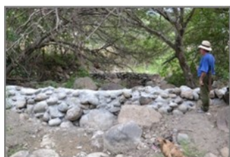
Retention ponds construction COMUNIDEC—Loja, Ecuador

Ecuador has been impacted by extreme climate-related events. Frequent and more intense rains and droughts have been increasing pressure on rural communities who are the most exposed and vulnerable, as their livelihoods greatly depend on the use and availability of natural resources such as water.