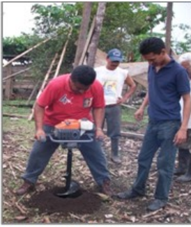
Plant seed dibbling Mocache—Los Ríos, Ecuador

(Continued from page 1) - Supporting Climate Change Adaptation in Latin America