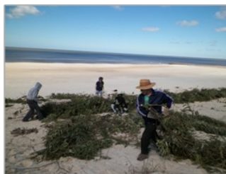
Dune recovery efforts in La Floresta beach

The Department of Canelones has more than 14km of coast which is increasingly facing climate-related erosion. To reverse this pattern, in four beaches of this Department (El Pinar, Parque del Plata, Pinamar and La Floresta) dune recovery activities have been implemented